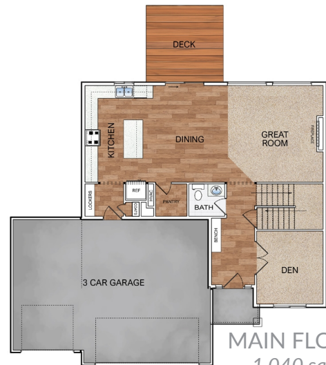
MAIN FLOOR 1,040 sqft